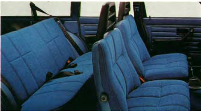
Plenty of room for five and 42 cu.ft. of luggage. Folding the rear seat increases this to almost 70 cu.ft.