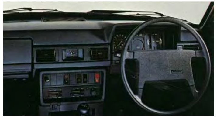
The instrumentation includes a comprehensive system of warning and reminder lights.

Engine Four-cylinder, in-line, water-cooled with aluminium alloy cylinder head and overhead camshaft.