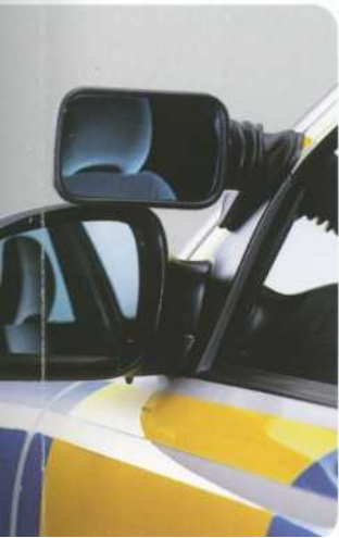
ADDITIONAL EXTERNAL REAR VIEW MIRROR (Option)