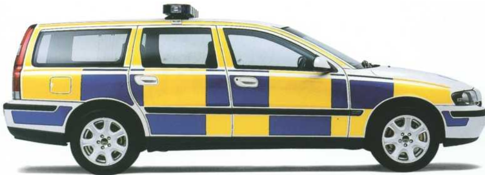
VOLVO V70 POLICE CAR Front-wheel drive. Alternative engines: five-cylinder 250-bhp turbo petrol engine or a five-cylinder 163-bhp direct-injection turbodiesel. Five-speed manual gearbox or five-speed adaptive automatic transmission (not available with the diesel engine). Reinforced police-specification chassis with DSTC anti-skid system and automatic height control.

The Volvo cars have what it takes to make a world-class police car with superior crash safety, dynamic ride and road holding with high levels of comfort.