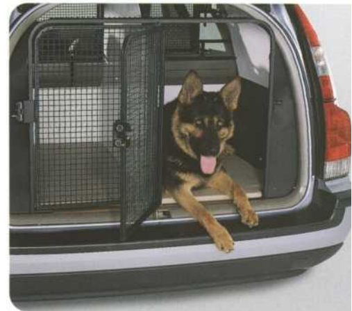
DOG COMPARTMENT Divided into two sections, with excellent ventilation. The compartments are designed with consideration for the dogs' safety and comfort. The dogs can be released either to the rear or via electrically operated hatches forward onto the rear seat. The durable interior trim is easy to keep clean. (Optional for the Volvo V70 and Cross Country.)