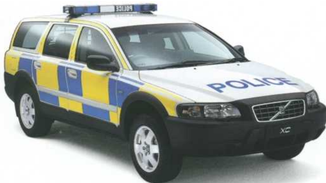
VOLVO CROSS COUNTRY POLICE CAR Four-wheel drive (AWD/TRACS) and greater ground clearance. Five-cylinder 200-bhp turbo petrol engine. Five-speed manual gearbox or five-speed adaptive automatic transmission. Automatic height control.

The Volvo Police cars are individually tailored at the Volvo Car Special Vehicles' workshop in Goteborg ready for final commissioning in the UK according to the customer's build specification.