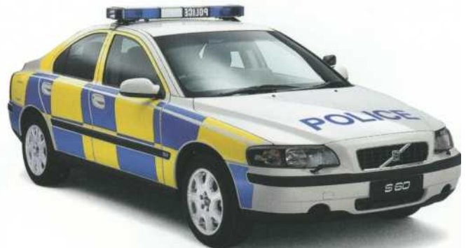
VOLVO S60 POLICE CAR Front-wheel drive. Alternative engines: five-cylinder 250-bhp turbo petrol engine or a five-cylinder 163-bhp direct-injection turbodiesel. Five-speed manual gearbox or five-speed adaptive automatic transmission (not available with the diesel engine). Sport chassis with DSTC anti-skid system and automatic height control.