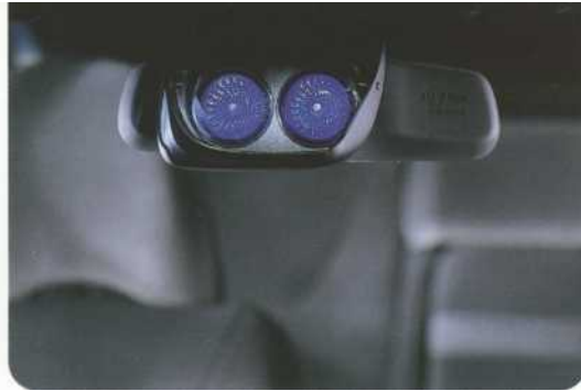
BLUE FLASHING LAMPS IN WINDSCREEN (Option)