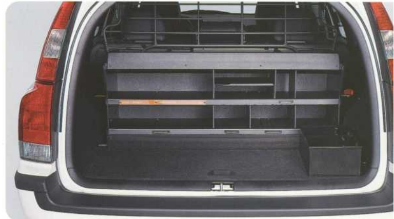
STORAGE SYSTEM The storage system is easily modified to suit varying needs. (Option)