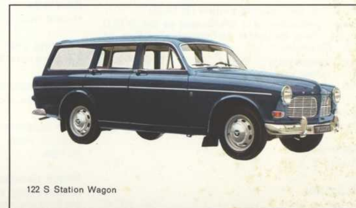
122 S Station Wagon