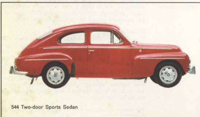
544 Two-door Sports Sedan