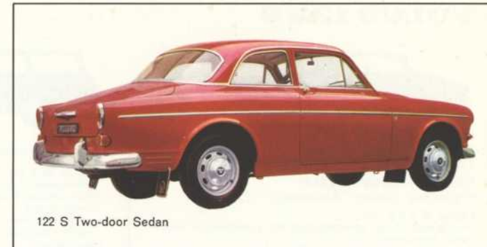
122 S Two-door Sedan