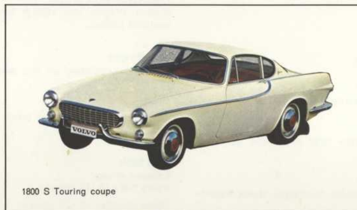
1800 S Touring coupe