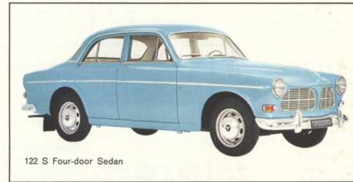
122 S Four-door Sedan