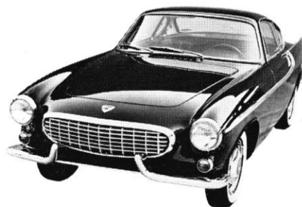
This is the Volvo 1800 S. It's obviously not a compact. If we told you how good the 1800 S is you wouldn't believe us. So here's what Road & Track, an automotive magazine, wrote about it: "The 1800 S is a very civilized touring car of the type much in the news these days—but at a price that many people who cannot afford a Ferrari or Aston Martin will be able to pay." You pay over $10,000 for a Ferrari or Aston Martin. You pay $3995 for the Volvo 1800 S. West Coast slightly higher.