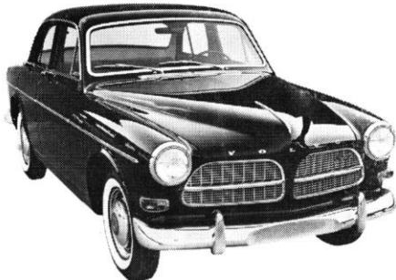
This is the Volvo 122 S compact. It's an offshoot of the 544 and performs just as well. In fact the 122 S is the current World Rally Champion. It's also available as a 2-door sedan and a 4-door station wagon. Like all Volvos, it gives you a choice of sensible colors: Black, Red, Light Blue, Dark Blue, Grey, Sand, and White.