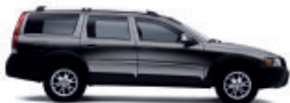
455 Titanium Grey pearl