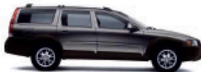
468 Lava Sand pearl