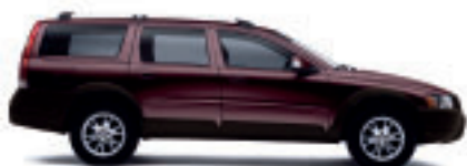
463 Blackcurrant pearl