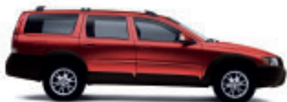
454 Ruby Red pearl