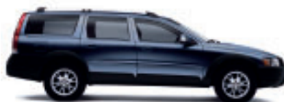
466 Barents Blue pearl