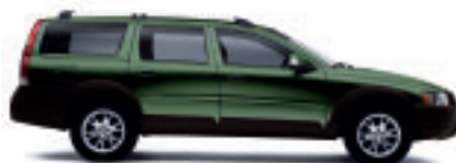
465 Cedar Green pearl