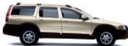
469 Lunar Gold pearl