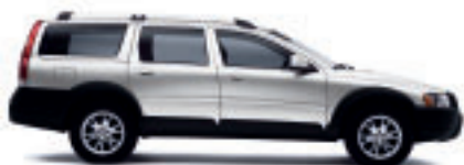
426 Silver metallic