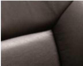
Leather-faced Brown (B984)