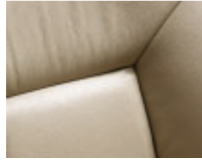
Leather-faced Light Sand (B951)