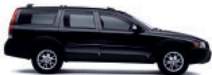
452 Black Sapphire metallic