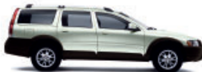
471 Willow Green pearl