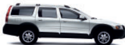
477 Inscription™ Electric Silver Coarse Flake metallic