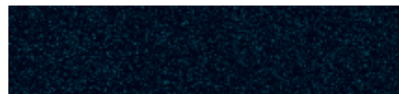
467 Magic Blue pearl