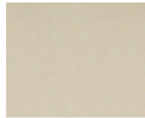
Gobi Soft Leather (9577)