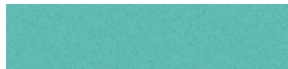
457 Flash Green metallic