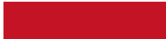
612 Passion Red