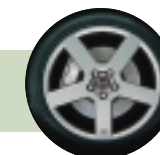
18" Pegasus (Graphite)