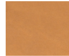
Atacama Natural Leather (9675)