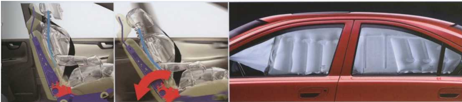
WHIPS (Whiplash Protection System) reduces the strain on the spine and neck in rear-end collisions. It is integrated in the front seats and is activated if a rear impact is sufficiently severe.

slippery roads or are forced to take extreme evasive action. And if an accident simply cannot be avoided, you and your fellow occupants are protected by the same world-leading safety systems that save lives in other Volvo cars.